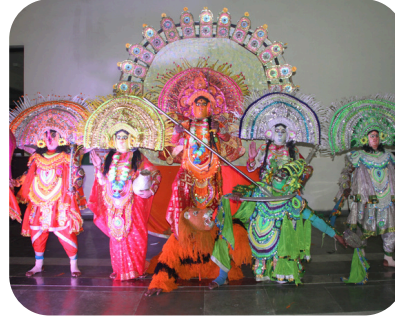
Chau Dance Group West Bengal Folk Artists