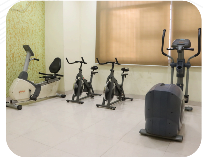
Well equipped Gymnasiums