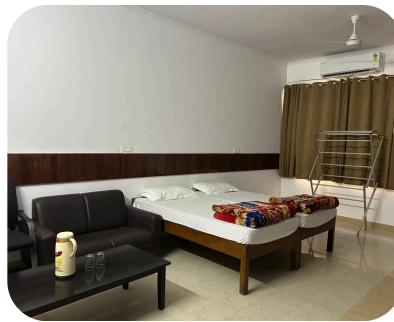
Equipped with 50 rooms