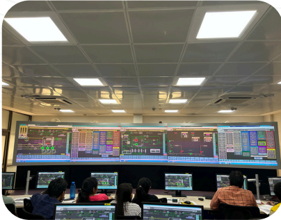
800 MW Simulator