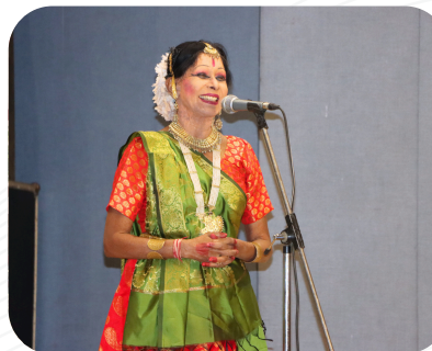
Padma Shri Shovana Narayan Indian Kathak Dancer