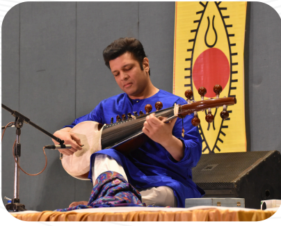
Amaan Ali Bangash Sarod Maestro