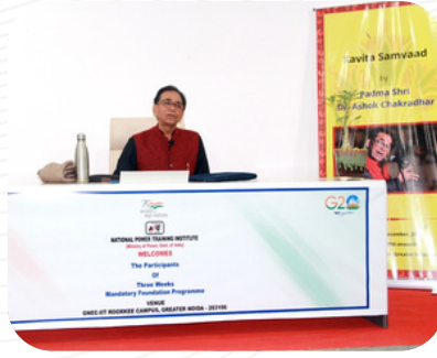
Padma Shri Ashok Chakradhar, Indian author, poet and former head of the department of Hindi at Jamia Millia Islamia