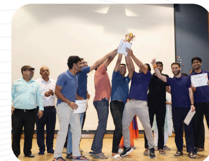
Sports Symposium, Annual Sports Fest of NPTI