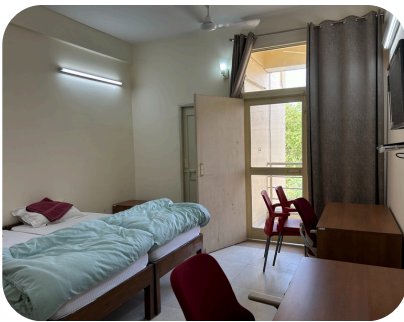
Equipped with 25 rooms