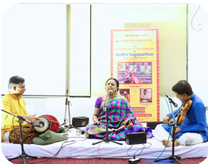
Padma Bhushan Sudha Ragunathan Indian Carnatic Vocalist