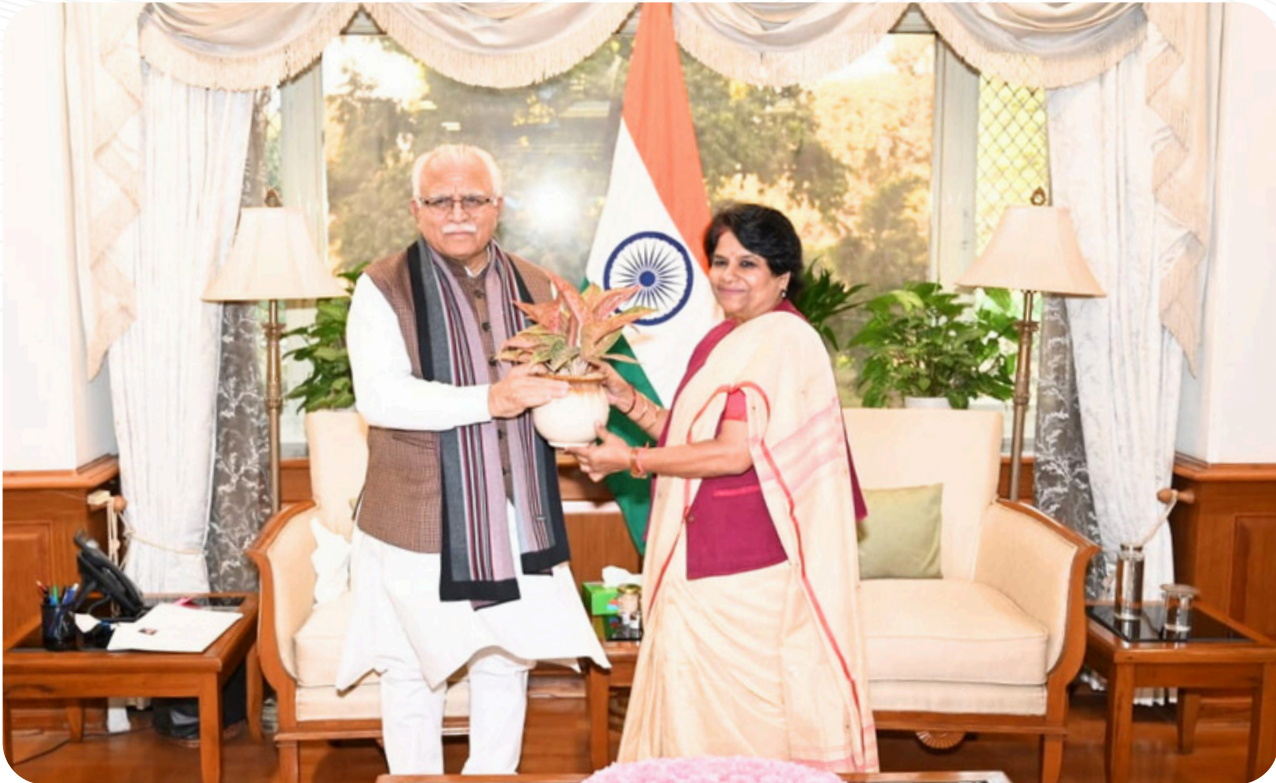
Dr. Tripta Thakur, Director General NPTI with Shri M. L. Khattar, Hon'ble Minister of Power, Government of India

The Indian energy sector, particularly the power sector, is at the cusp of a transformative journey, driven by the nation's commitment to achieve sustainable development goals and its pivotal role in the global energy transition. As a signatory to the COP-26 commitments, India has pledged to achieve net-zero emissions by 2070, reduce the carbon intensity of its economy, and achieve 50% of its energy requirements from non-fossil fuel sources by 2030.