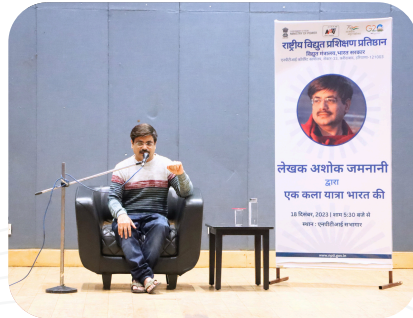
Ashok Jamnani Indian Poet & Writer