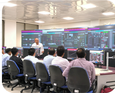
500 MW Simulator