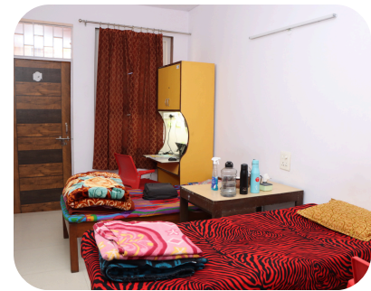
Equipped with 120 rooms