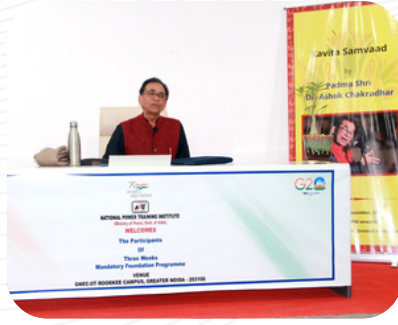
Padma Shri Ashok Chakradhar, Indian author, poet and former head of the department of Hindi at Jamia Millia Islamia