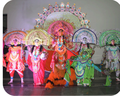
Chau Dance Group West Bengal Folk Artists