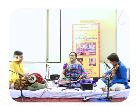
Padma Bhushan Sudha Ragunathan Indian Carnatic Vocalist