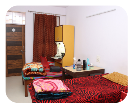
Equipped with 120 rooms