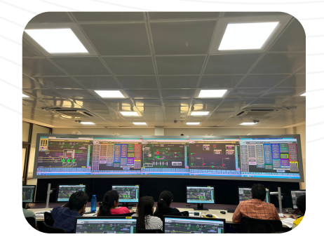
800 MW Simulator