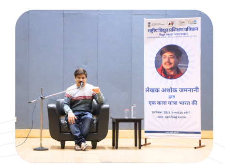
Ashok Jamnani Indian Poet & Writer