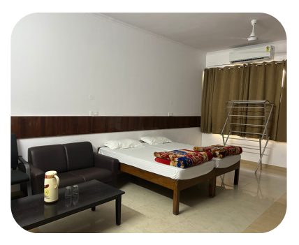
Equipped with 50 rooms