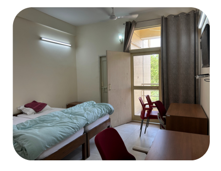
Equipped with 25 rooms