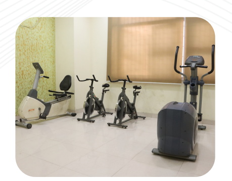
Well equipped Gymnasiums