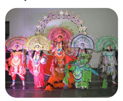
Chau Dance Group West Bengal Folk Artists