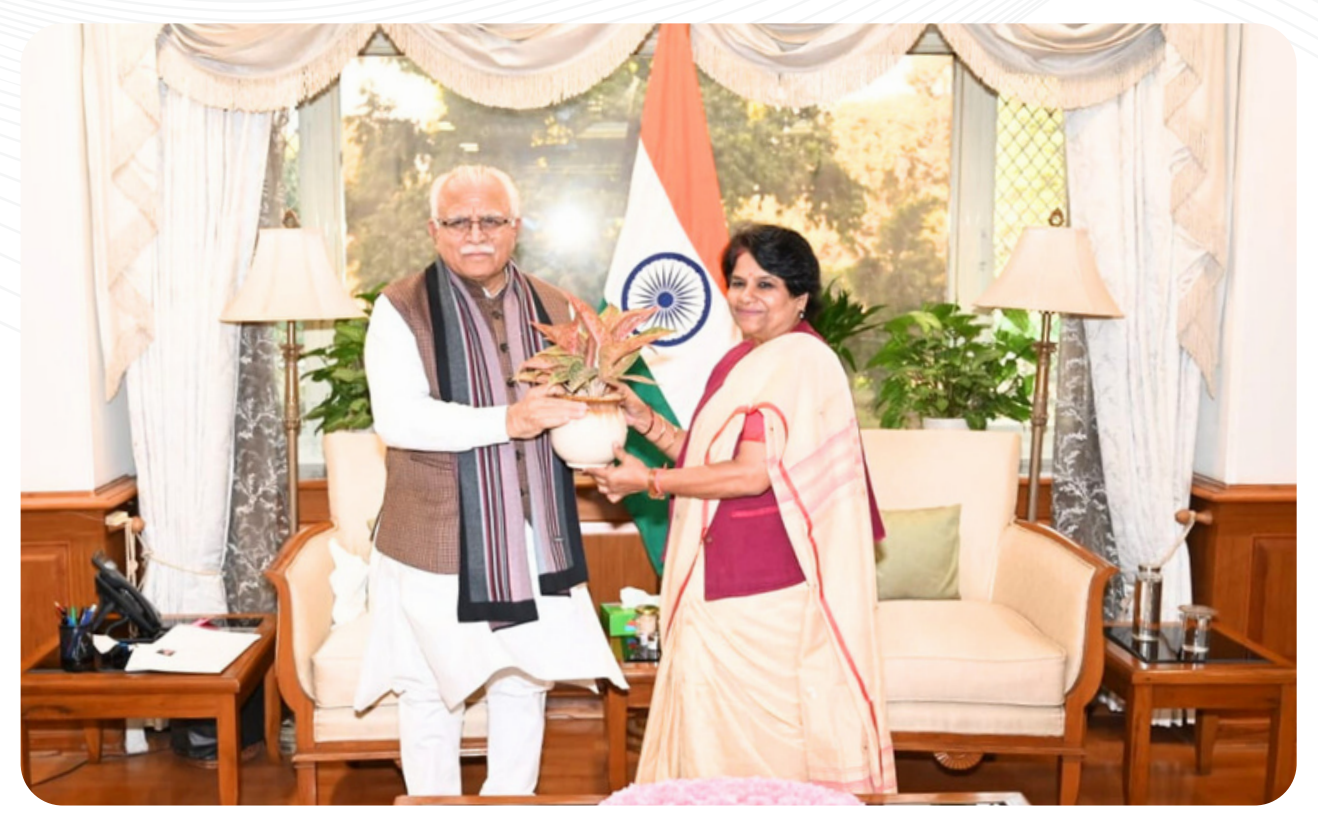
Dr. Tripta Thakur, Director General NPTI with Shri M. L. Khattar, Hon'ble Minister of Power, Government of India

The Indian energy sector, particularly the power sector, is at the cusp of a transformative journey, driven by the nation's commitment to achieve sustainable development goals and its pivotal role in the global energy transition. As a signatory to the COP-26 commitments, India has pledged to achieve net-zero emissions by 2070, reduce the carbon intensity of its economy, and achieve 50% of its energy requirements from non-fossil fuel sources by 2030.